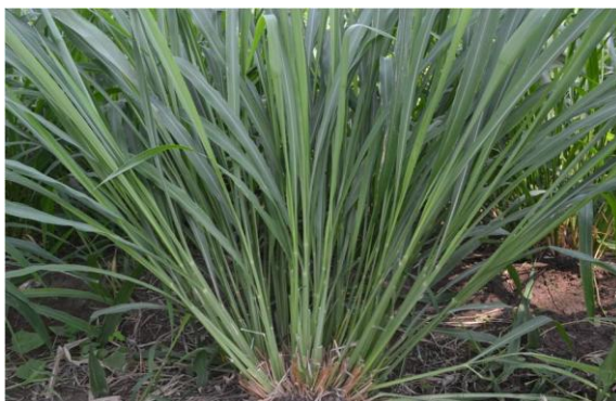
Exuberant tillering nature of CO (GG) 3