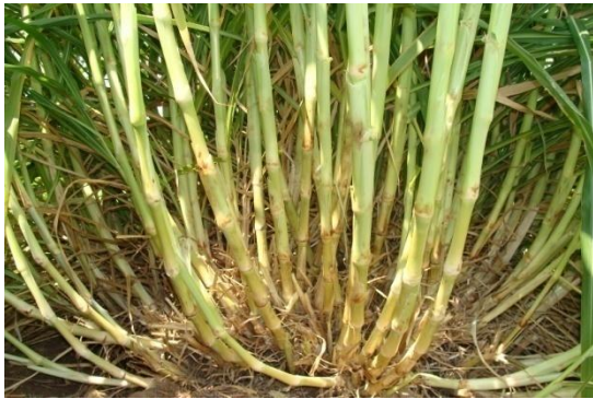
Plumbly clump of CO (BN) 5