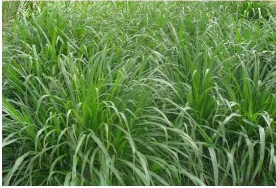
Luxurious growth of CO (BN) 5