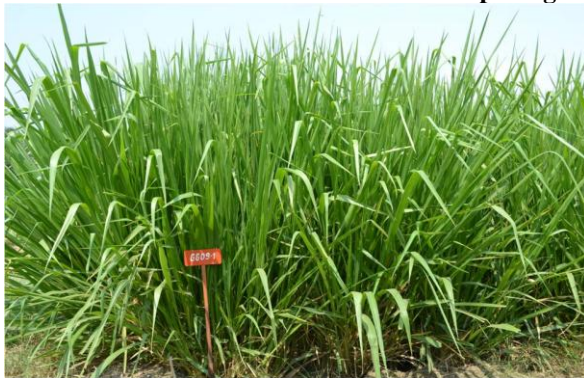
Luxurious growth of CO (GG) 3