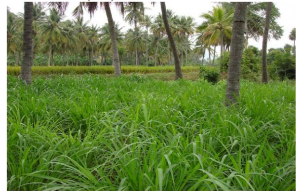
Tolerant to shade; suited for coconut groves