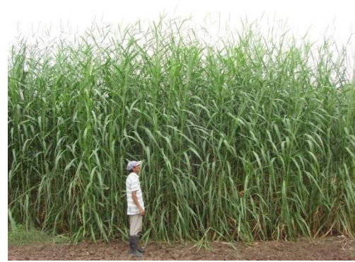
Erect and non lodging habit of CO (BN) 5