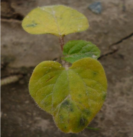
65kR+ 1.4% EMS