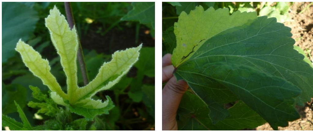
Fig. 1(a,b). Lethal chlorophyll mutants (albino and xantha) in {\rm M}_2 generation of okra