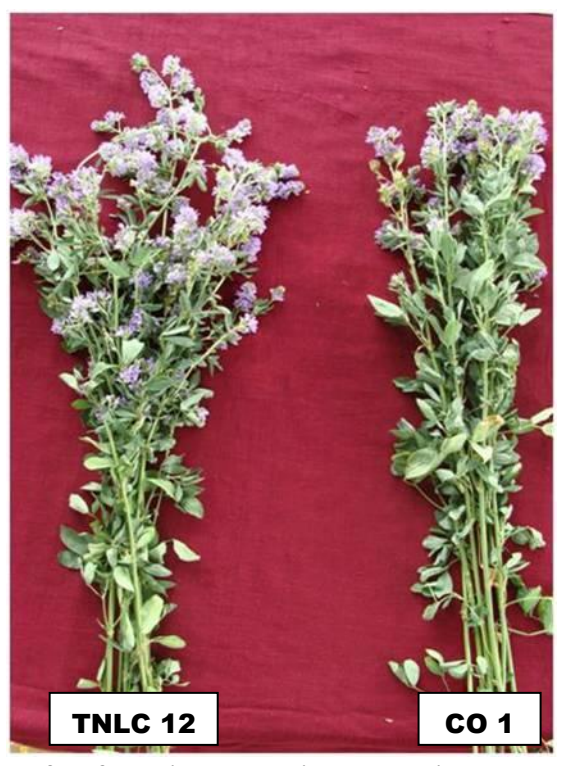
Profuse flowering leaves higher seed yield