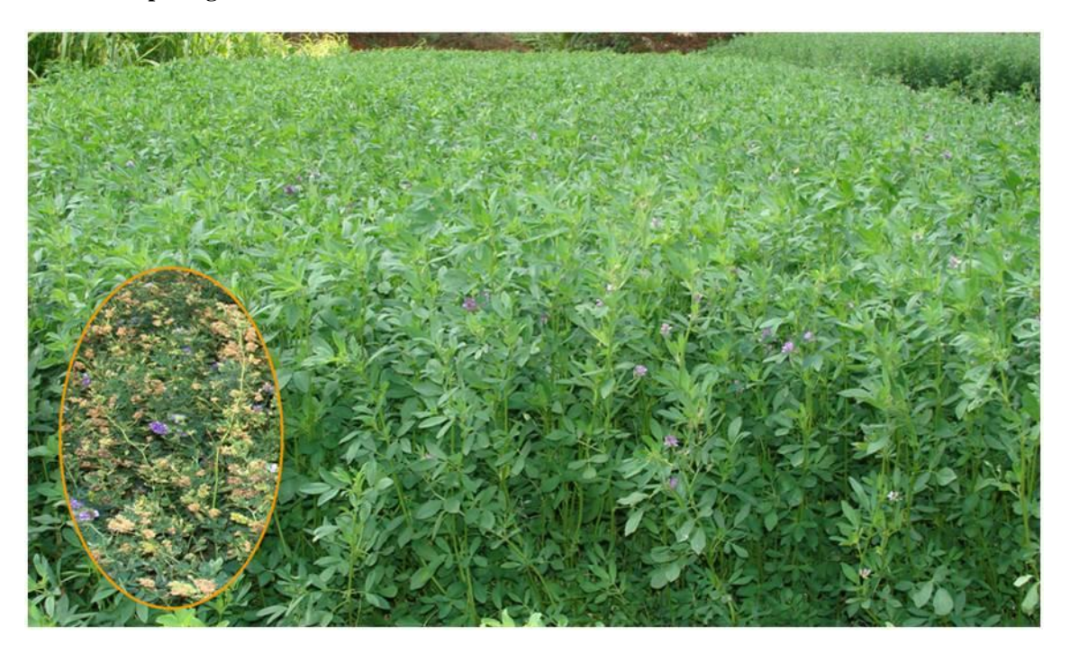
Luxurious growth of TNLC 12, a sight to behold