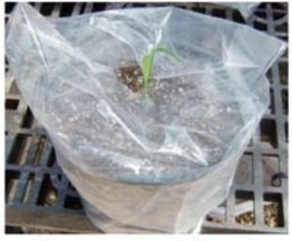
Maize plant pot covered with poly bag

*Significant at 5% level, ** significant at 1% level