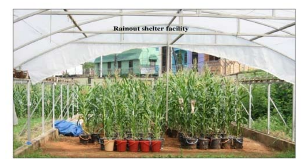
Photo 1. Transpiration efficiency experiment setup under rainout shelter facility