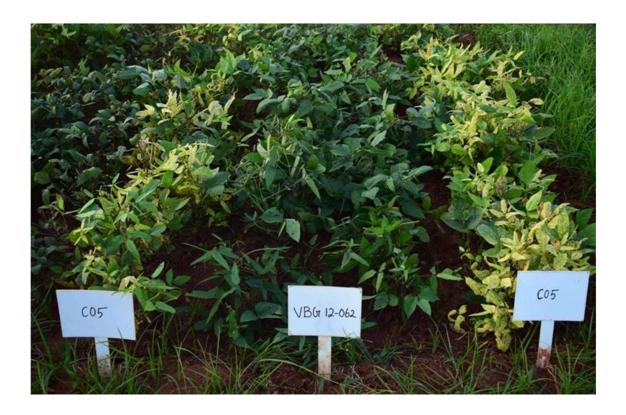
Fig 1. Evaluation of MYMV disease resistance of blackgram culture VBG 12-062 with susceptible check CO 5 under infector row method at NPRC, Vamban during kharif 2017

The blackgram variety VBN 11 was differentiated from other popularly grown genotypes viz. , VBN 6 and VBN 8 using the molecular markers. A total of 10 SSR markers viz. , CEDGAAG002, CEDG225, CEDG298, CEDG154, CEDG003, CEDG091, CEDG048, CEDG220, CEDG173 and CEDG097 were taken for the study. Among these two SSR markers viz. , CEDGAAG002 and CEDG225 had differentiated the varieties ( Table 8 and Fig. 2 ). Marker CEDGAAG002 had polymorphism between VBN 11 and