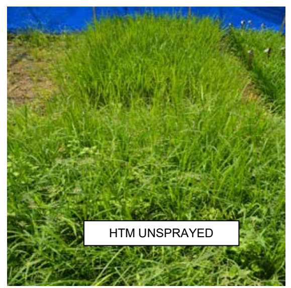
Fig. 1C Performance of HTM-Robin on Imazethapyr spray