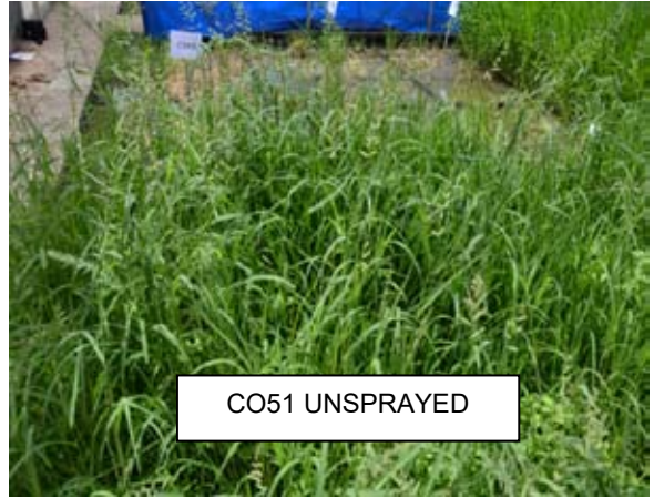
Fig. 1A Performance of CO51 on Imazethapyr spray