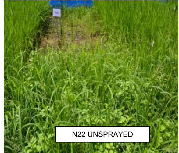
Fig. 1B Performance of Nagina 22 on Imazethapyr spray