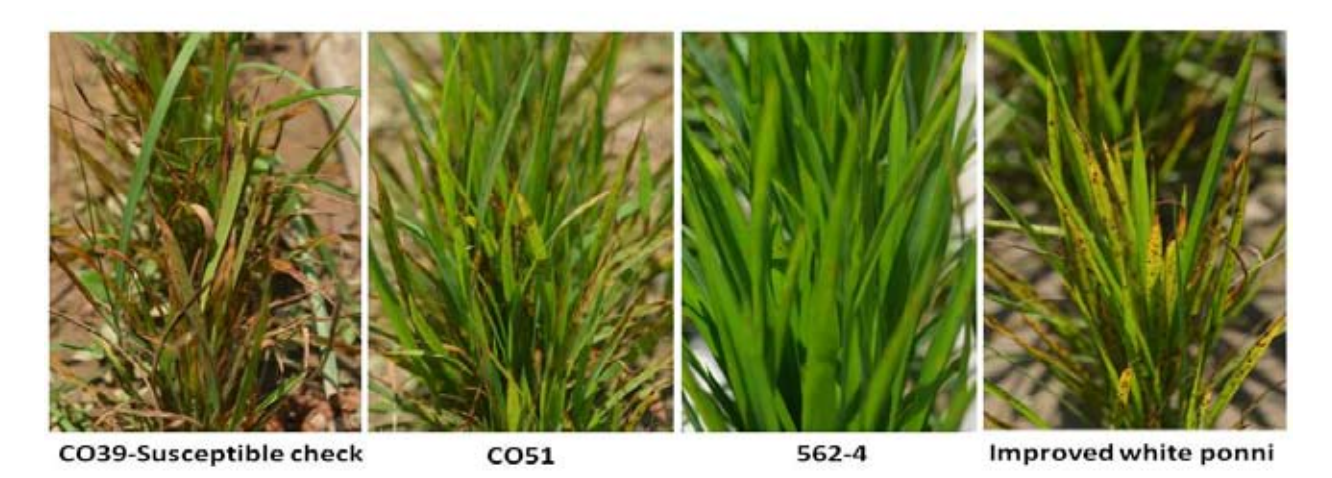
Fig. 2. Blast screening evaluation of 562-4 harboring Pi9, CO51 harboring Pi54 and Improved White Ponni without Pi9 and Pi54 resistance genes, along with CO39 susceptible check.

Results of blast screening revealed complete susceptibility of CO39 against Tamil Nadu isolate of blast pathogen ( Fig. 2 ). CO39 started developing symptom within 18 days and severe symptom was observed in 45 days. Similarly, Improved White Ponni (IWP) showed severe symptom in 45 days. CO51 (containing Pi54 gene) and 562-4 (containing Pi9 gene) were found to exhibit moderate resistance against blast pathogen. At 45 days, they had small round spots with a score of 3 ( Fig. 2; Table 3 ). Blast is a major biotic stress, which causes severe yield losses in rice globally. In recent times majority of high yielding