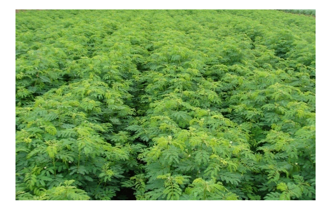
Fig. 1. Field view of Desmanthus TND 1308

With regard to quality aspects, TND 1308 registered its superiority for dry matter yield (DMY) of 115 q/ha and dry matter yield of 0.55 q/ha/day which was 15.15 and 14.58 per cent over the national check CO 1, respectively. It ranked first for dry matter yield (q/ha) and dry matter yield (q/ha/day) among the cultures evaluated under AICRP on FC & U trials. The dry matter portion of the feed indirectly indicates the quality of fodder (John moran, 2005). The culture has registered the dry matter yield of 14.12 q/ha and crude protein content of 15.58 per cent which is 10.37