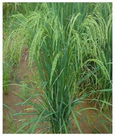
Fig.1. Individual Plant VG09006