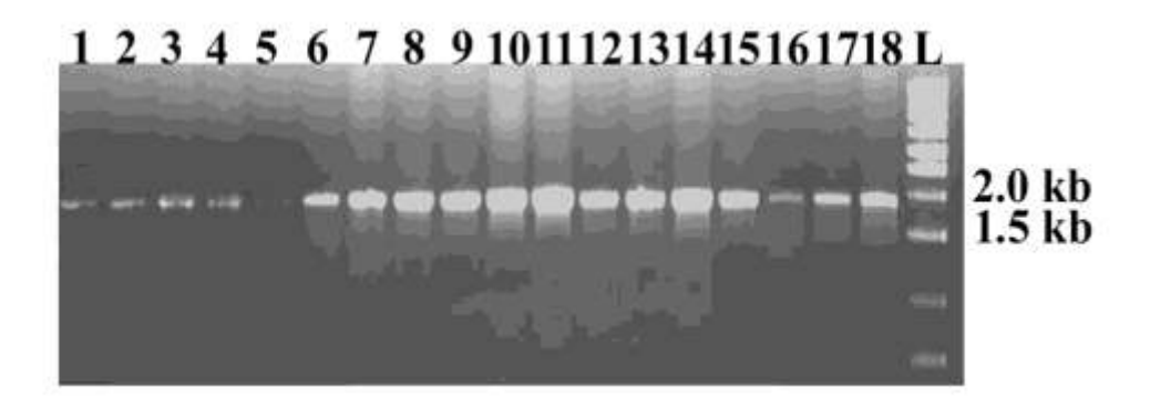
Figure 2. Amplification of a nad 4 region in maize inbred lines. Lanes 1 to 18 correspond to inbred lines mentioned in Table 1. L: 1 kb ladder.

Figure 1. Identification of cytoplasm types in maize inbred lines by PCR. Lanes 1 to 18 correspond to inbred lines mentioned in Table 1. Lane 19: positive control includes DNA from inbred lines 1, 3 and 8. L: 100 bp ladder.