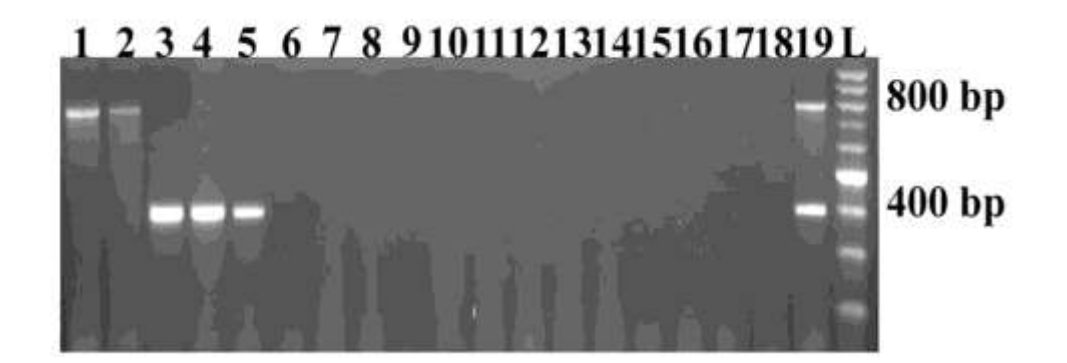
Figure 1. Identification of cytoplasm types in maize inbred lines by PCR. Lanes 1 to 18 correspond to inbred lines mentioned in Table 1. Lane 19: positive control includes DNA from inbred lines 1, 3 and 8. L: 100 bp ladder.