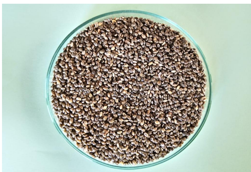
Fig.2. Seeds of new variety PMV 442 (GPUP 25)