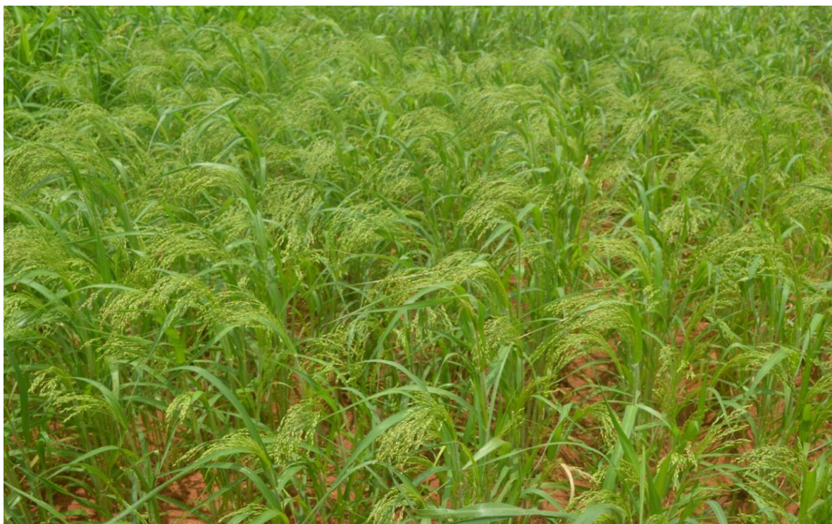
Fig.1. Field view of new variety PMV 442 (GPUP 25)

PMV 442 (GPUP 25) noticed more grain calcium (26.0 mg/100 g) content compared to the check TNAU 164. This variety has iron content of 6 mg/100 g of seed, 7.41 per cent protein, and 26.0 mg/100 g of calcium and 9.72 g/100 g of crude fiber. Grain quality characteristics of variety PMV 442 (GPUP 25) over national check TNAU 164 is presented in Table 8 .