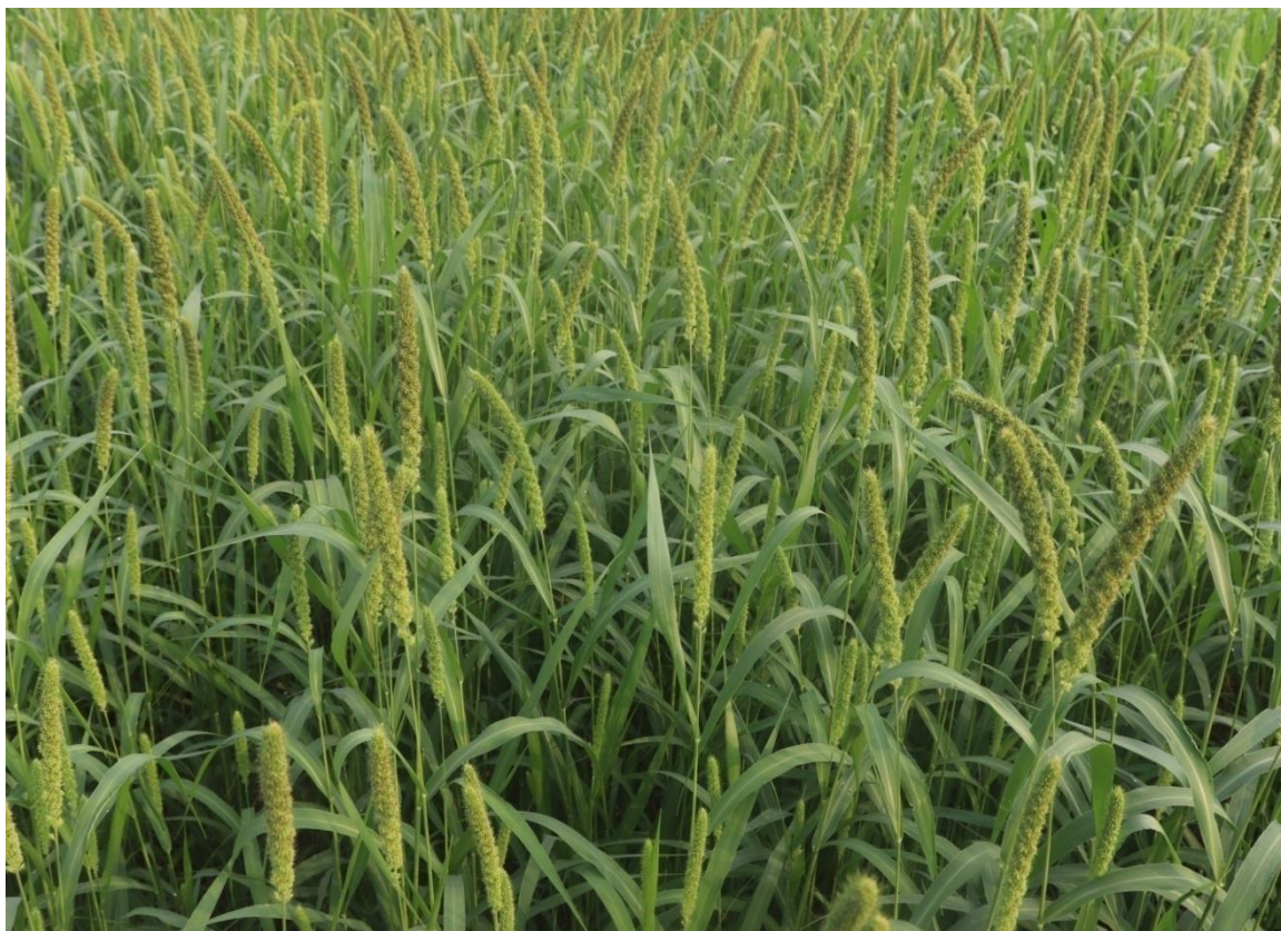
Fig.1. Field view of new variety GPUF 3