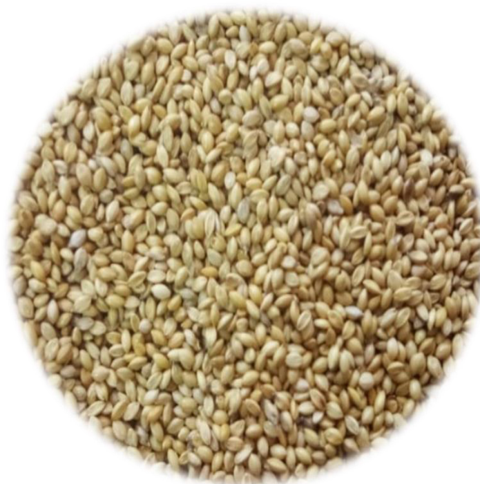
Fig. 2. Seed of new variety GPUF 3