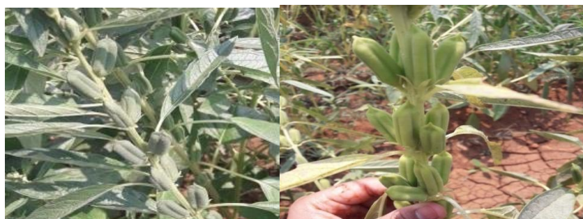
Fig. 4. One capsule per leaf axil