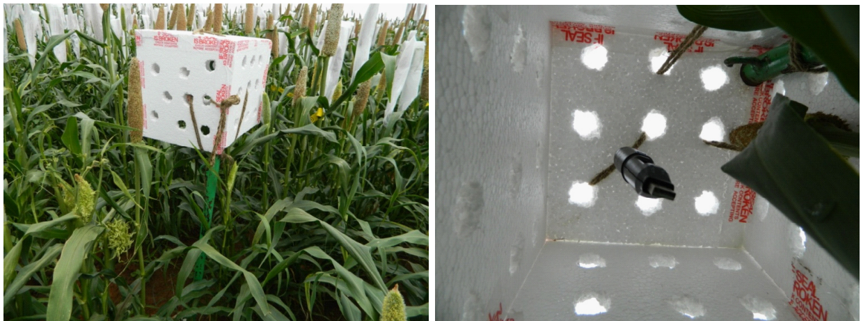
Fig. 1. Data loggers mounted (at plant height) near to the each genotype plots for recording air temperature and relative humidity at specified intervals.