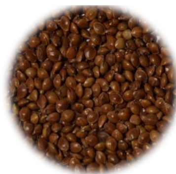
Fig.1. Morphological differences among kodo millet genotypes