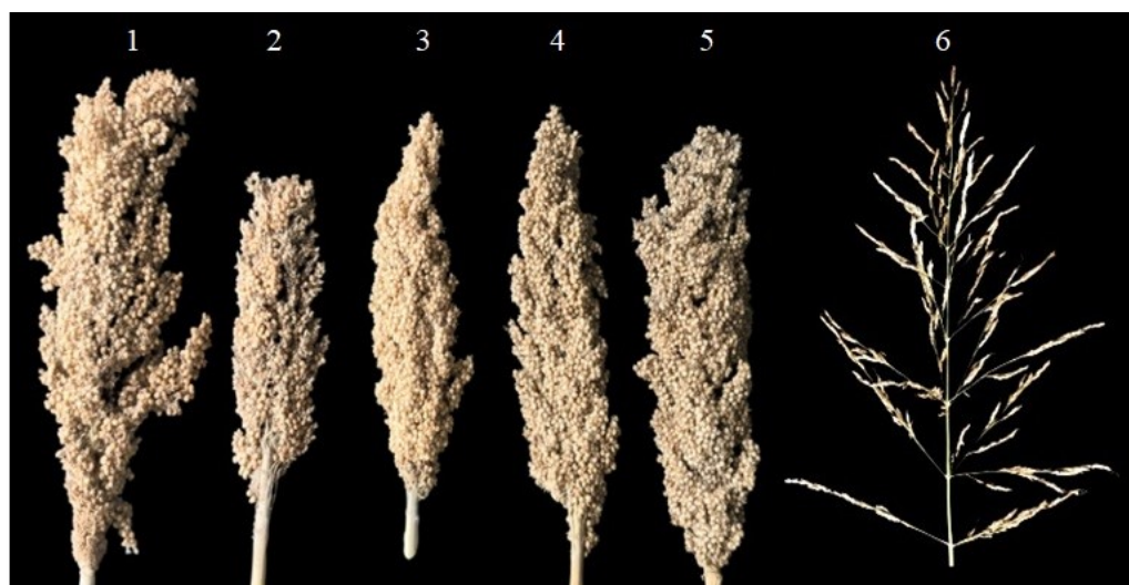
Fig. 2. Panicle shape of the sorghum varieties/ culture and fodder sorghum.

used for differentiating CO 32 (175bp) from K8, K12, CO (S) 28 and TNS 661. The dwarf genotypes could be used for developing desired plant types whereas genotypes with increased plant height are prone to lodging. But, beneficial as fodder, biomass fuel and thatching (Bhusal et al. 2017). From this perspective TNS 660 and TNS 661 were short (76 - 150 cm) whereas, CO 32 and CSV 33 MF were long (226 - 300cm). The SSR marker Xtxp231 can be used for differentiating CO 32 (210bp) from CSV 33 MF.