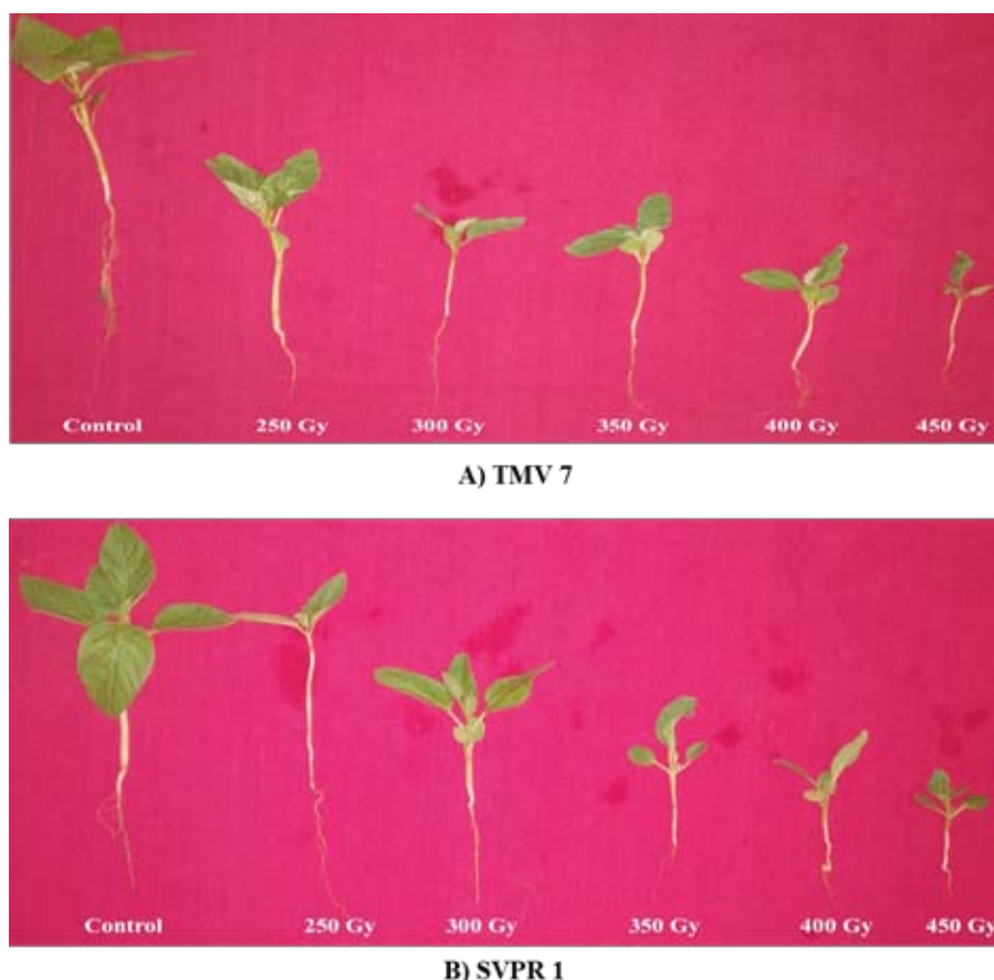
Fig.2 Effect of Gamma rays on root and shoot length at 30 days old seedlings of TMV7 (A) and SVPR1 (B)

(8.30 cm.). However, at 400 Gy SVPR1 (4.08) observed uptrend in root length whereas TMV7 showed a dose dependent reduction. At 350 Gy, TMV7 recorded 51.01% reduction whereas SVPR1 observed 45.82% and 60.89 % reduction in root length at 300 and 350 Gy respectively. In case of shoot length a gradual reduction in both the genotypes was observed and at 450 Gy significant reduction of 66.79% (SVPR1) and 46.78 % (TMV7) was observed ( Fig 2 ).