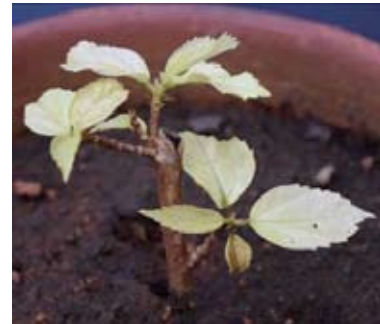
xantha @ 30 Gy gamma-radiation