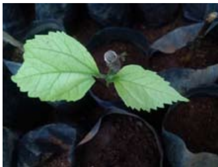
albino @ 30 Gy gamma- radiation