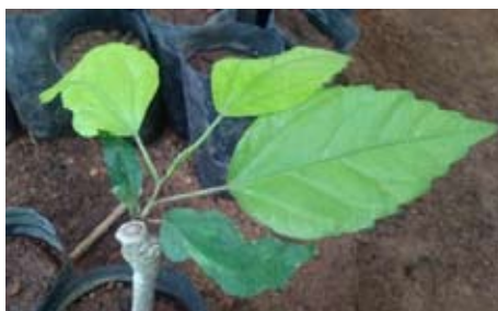
viridis @ 0.9% EMS