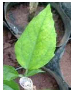
chlorina @ 0.8% EMS