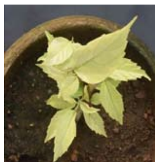
xantha @ 35 Gy gamma - radiation