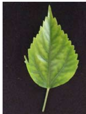
xantha-viridis @ 25 Gy gamma - radiation