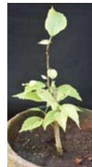
xantha @ 1.0% EMS