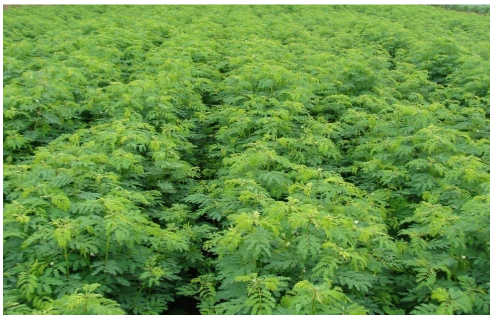
Fig. 1. Field view of Desmanthus TND 1308

With regard to quality aspects, TND 1308 registered its superiority for dry matter yield (DMY) of 115 q/ha and dry matter yield of 0.55 q/ha/day which was 15.15 and 14.58 per cent over the national check CO 1, respectively. It ranked first for dry matter yield (q/ha) and dry matter yield (q/ha/day) among the cultures evaluated under AICRP on FC & U trials. The dry matter portion of the feed indirectly indicates the quality of fodder (John Moran, 2005). The culture has registered the dry matter yield of 14.12 q/ha and crude protein content of 15.58 per cent which is 10.37