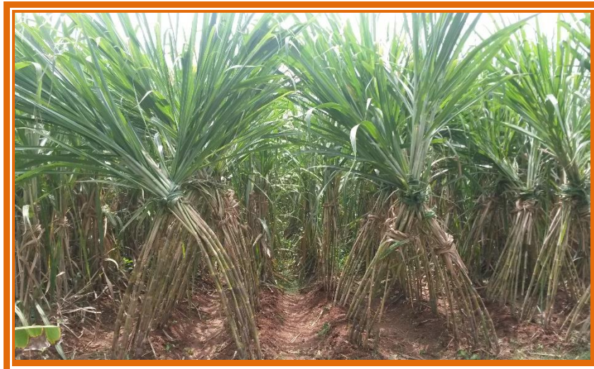
Fig. 1. Field stand of G2005 019 at 240 days