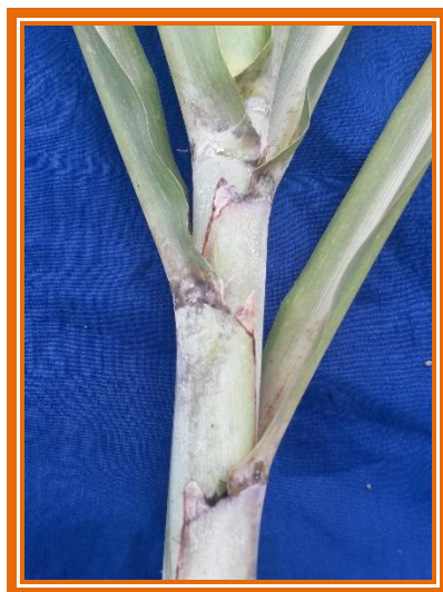
Fig. 3. Cane top of G2005 019