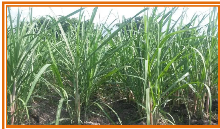
Fig. 2. Field stand of G2005 019 of 120 days