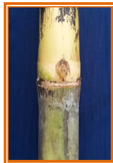
Fig. 4. Cane nodal region of G2005 019