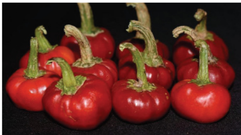
Fig. 1. Ramnad Mundu Chilli ( Capsicum annum L. )

in chilli is due to capsanthin, capsanthin 5,6-epoxide and capsorubin (Davies et al. , 1970). Capsaicin is mainly present in the placenta of the fruit, the level of pungency mainly depends on capsaicin and dihydrocapsaicin which contributes more than 80 per cent (Bosland and Votava, 2000). According to Kumar et al. (2012), capsaicin ranged in some chillies from 0.05 to 1.3 per cent and was grouped the lowest to highest pungency types, respectively.