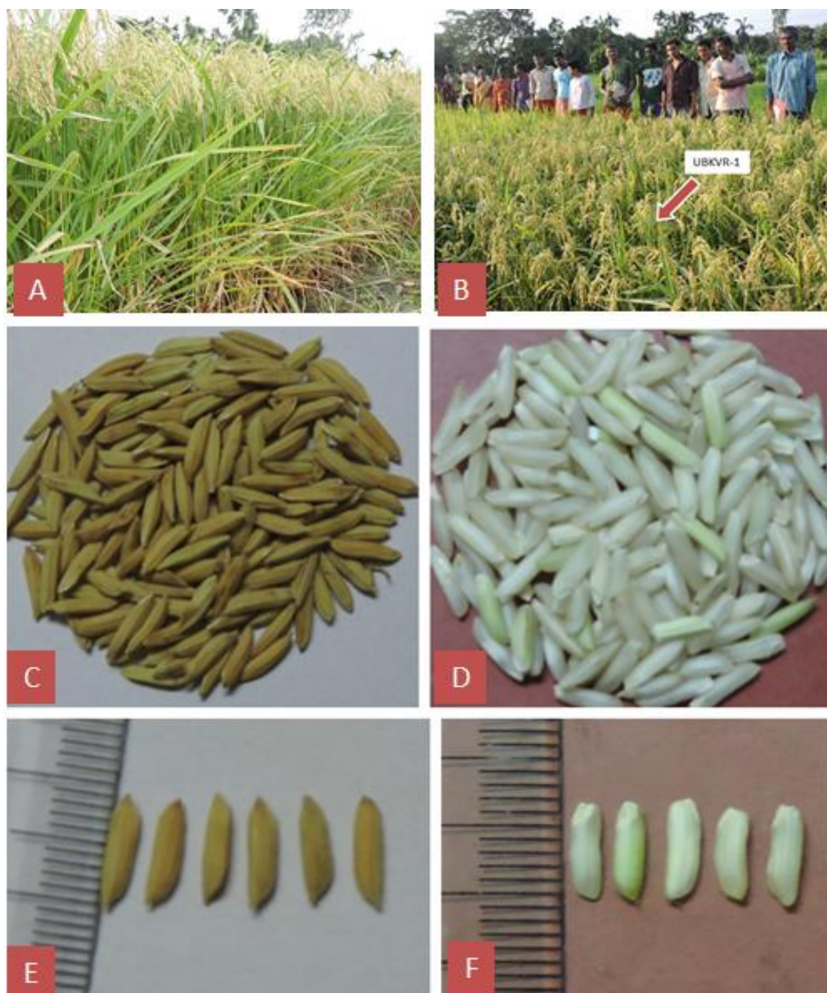
Fig. 1. Pictorial depiction of different features of Uttar Sona (IET 24171). A) Standing crop at famers' field (Shri Bharat Barman, Kharikabari, Unishbisha G.P., Mathabhanga-II, Cooch Behar district); B) Farmers' participatory varietal selection at Patlakhawa G.P. (Cooch Behar-II, Cooch Behar district, West Bengal)- farmers selected Uttar Sona along with other four varieties as best performing varieties; C) Un-dehusked rice of Uttar Sona; D) Dehusked rice of Uttar Sona; E) Length of un-dehusked rice Uttar Sona; F) Length of dehusked rice of Uttar Sona [length: 5.47 cm, breadth: 2.05 mm, L:B ratio- 2.66, gain type- medium slender].