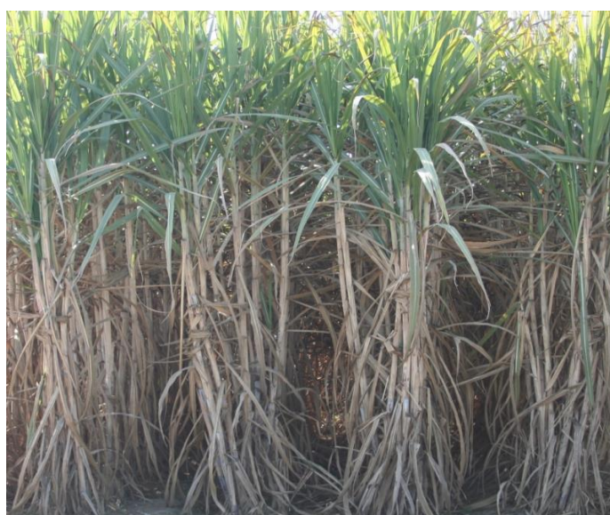
Field view of CoPb 14185

Based on per cent improvement over the best standard for CCS yield, cane yield and sucrose per cent, three clones viz., CoPb 14185, CoS 14233 and CoLk 14204 qualified in the zone while CoPb 14185 was the top