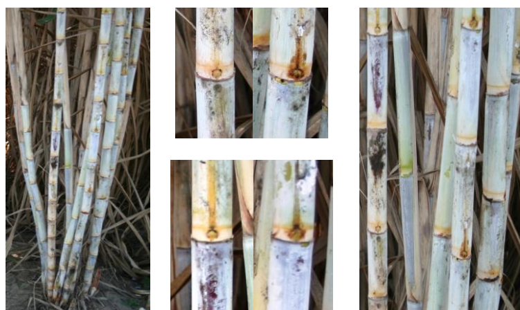
Single clump of CoPb 14185