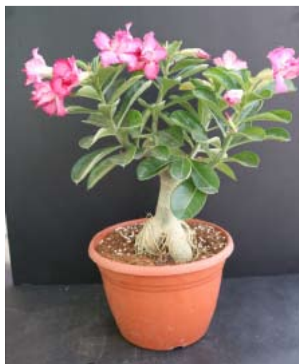
B) Compact growth habit