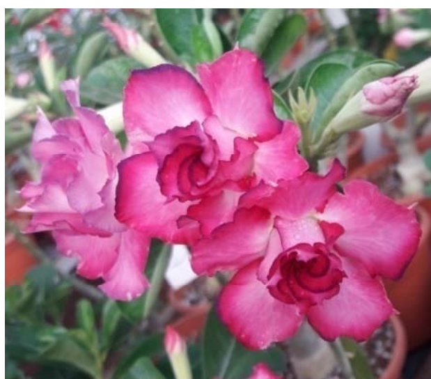
(A) Multipetal flower type