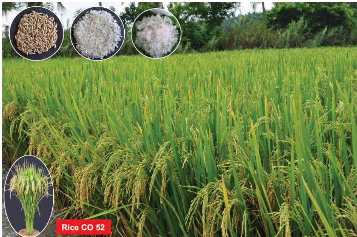
Plate 1. Morphological features and grain type of Medium Duration Fine Grain Rice Variety CO 52