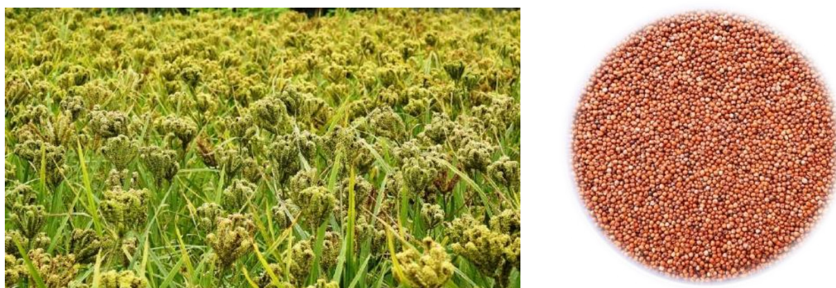
Fig. 2. Field view and seed photograph of the variety VL Mandua 380