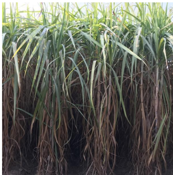
Field view of CoPb 96