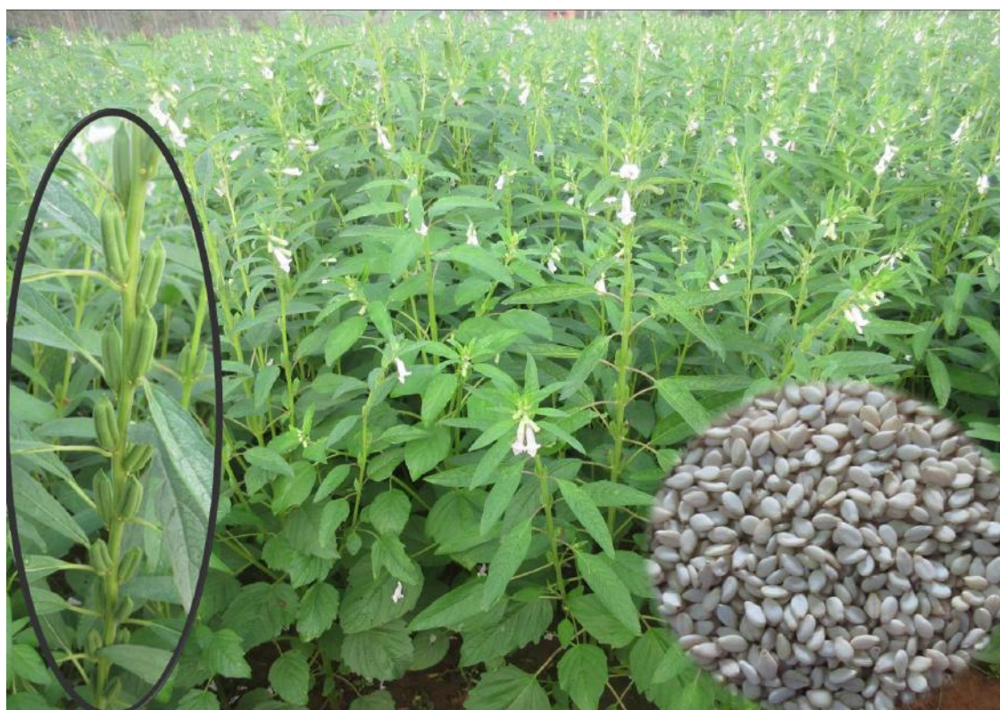
Fig. 2. Field view of Sesame VS 07 023 as VRI 3

Considering the supremacy of the Sesame culture VS 07 023, it was recommended for release by 52 nd Crop Scientists Meet on Oilseeds, 2016 by TNAU, Coimbatore and subsequently released as Sesame VRI 3 by 47 th SVRC during 2017 which is suitable for cultivation during rabi /summer irrigated conditions in major sesame growing districts of Tamil Nadu ( Fig. 2 ) and it has been notified vide Gazette Notification S.O. 1379 (E) dt. 27 th March 2018.