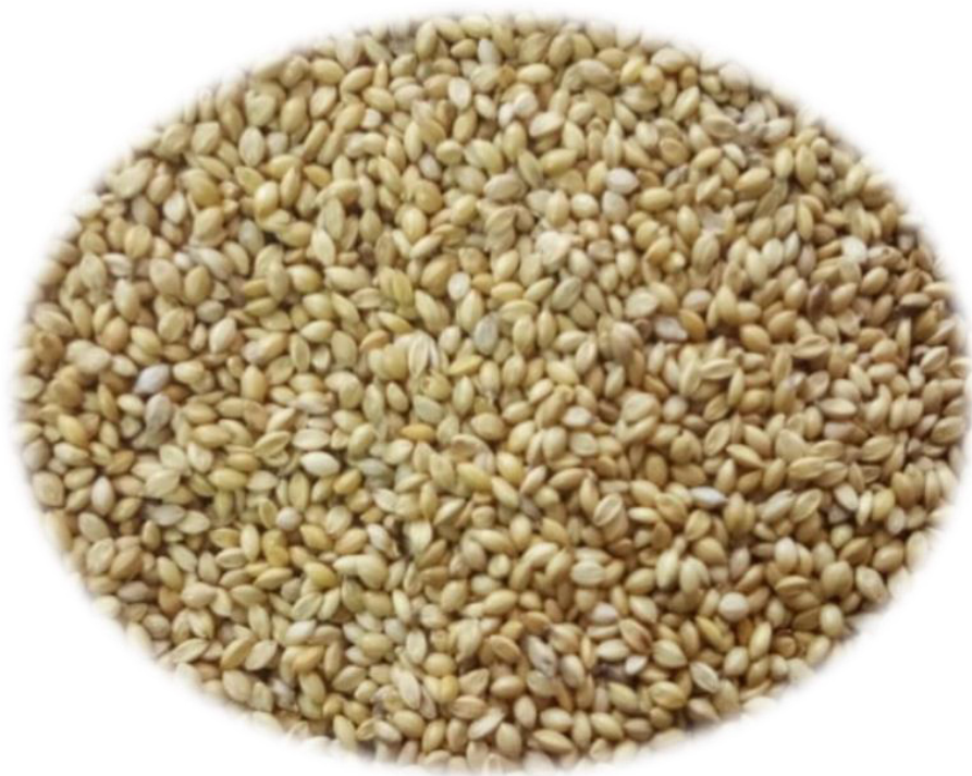
Fig. 2. Seed of new variety GPUF 3