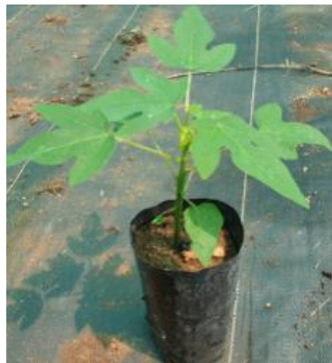
Control (0 Gy)