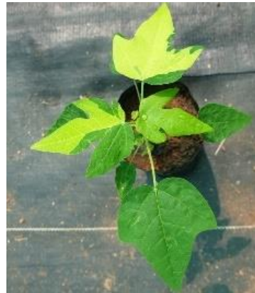
Xantha-Viridis (100 Gy)