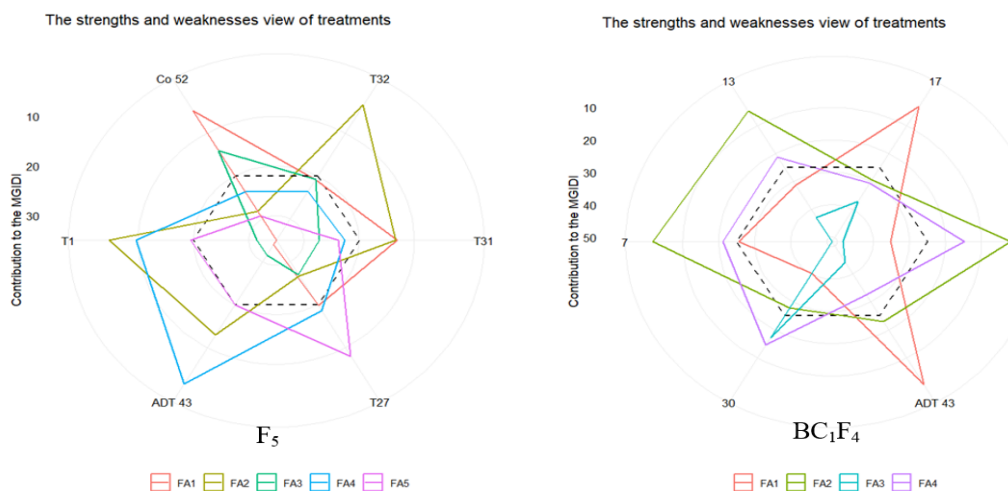
Fig. 3. Visualization of Strengths and Weaknesses of the selected genotypes in stabilized F 5 and BC 1 F 4 families.